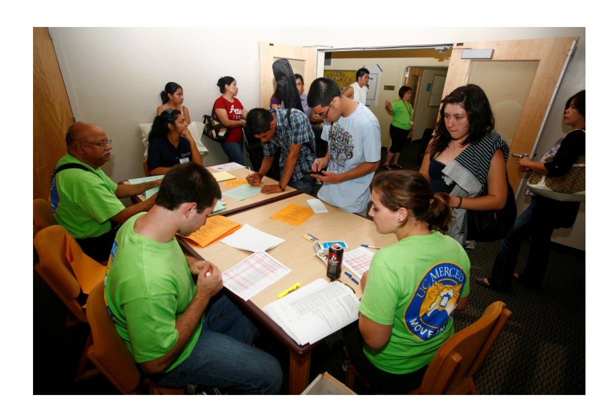
New Student Survey